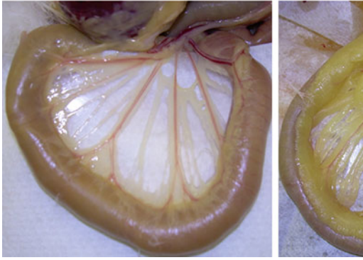
Fig. 2.1 Photographs of a part of small intestine in situ in a broiler breeder hen (18 weeks-old) showing excessive mesenteric adipose tissue accumulation due to unre-