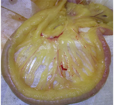
stricted feeding ( right ) compared to lesser level of adipose tissue following restricted feeding ( left ) (Ramachandran, unpublished data)