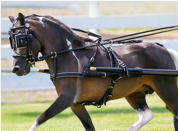
Running Martingale – only with jog cart, not with leverage bits

This publication is available in alternative media on request.