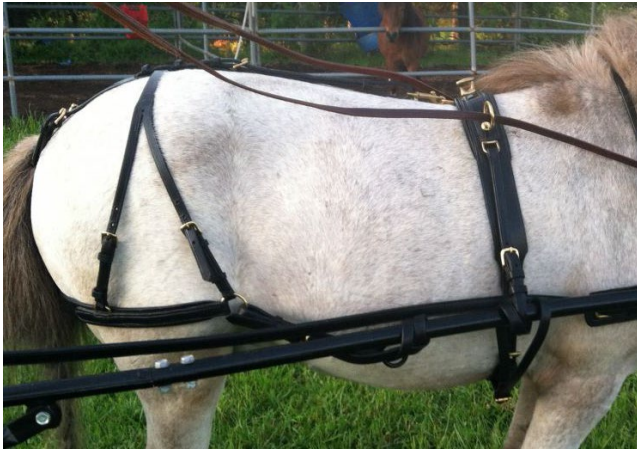
A. Breeching with Hold Back straps attached to loop in shafts