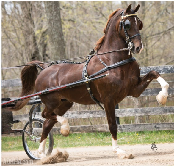
C. Fine Harness with fixed attachments to shafts