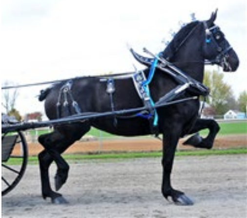
Draft Harness with Scotch Collar