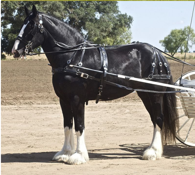
Draft Pleasure Harness