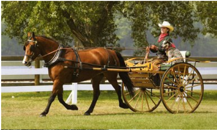
Pleasure Harness with Collar