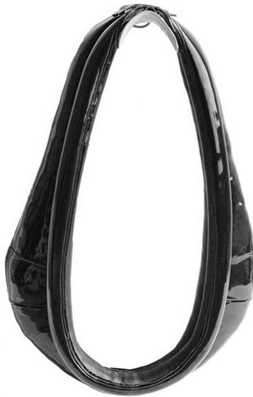
Left – Scotch Collar Right- Show Collar