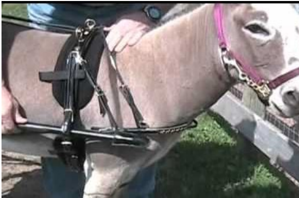
B. Breeching with Thimbles