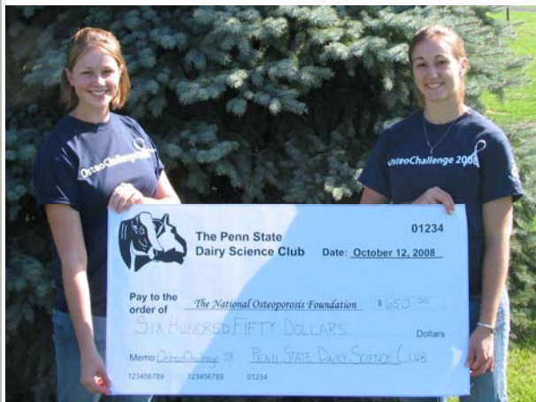
The October 2008 Osteochallenge raised more than $650 for the National Osteoporosis Foundation.

The Silver Anniversary Nittany Lion Fall Classic achieved an average of $4146, the highest ever in the sales series. Over sixty club members assisted with the