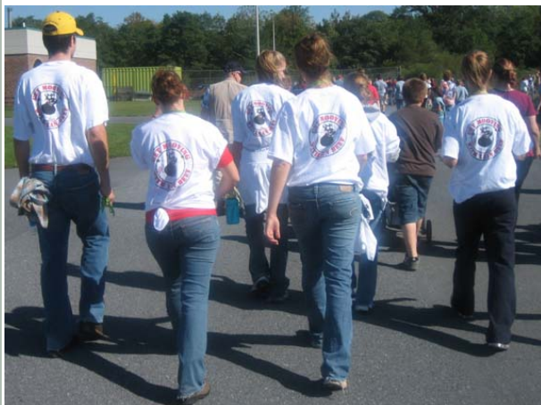
Block and Bridle members proudly display their Team Beef shirts during the Heart Walk on October 4th and 5th.

Intramural sports, the Ag Hill Olympics, a hayride with both Dairy Science and Agronomy club, the Holiday Semiformal with Dairy Science Club, and the fall meat sale rounded out fall activities.